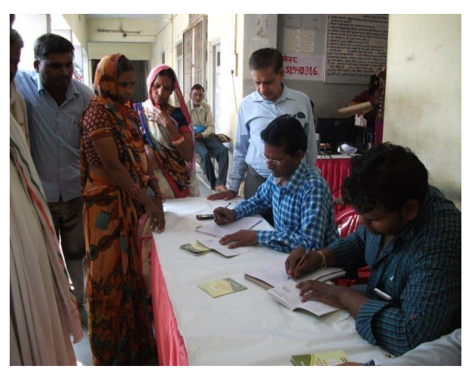
Registration of worker in Labour Department