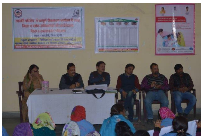
Bundi also appreciated the tool.

This training is conducted at Lakheri total 43 participants were participated in this training program. All 30 Anganwadi workers along with ANM , PHC staff under chairmanship of CMHO, Bundi. My Village my Home tool were displayed and filled in front of ANW workers. The tool was filled up by bottom –up method. CMHO